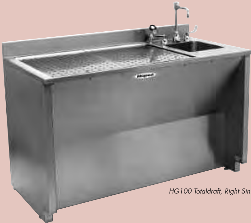
HG100 Totaldraft, Right Sink Approach