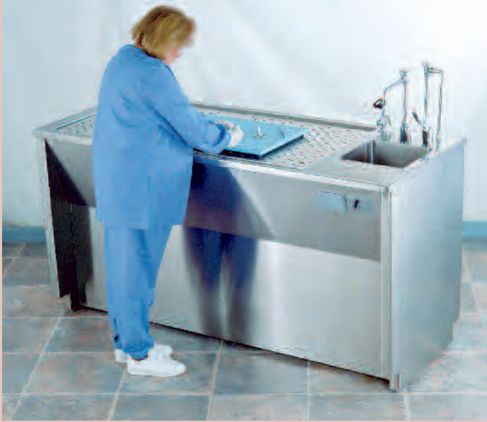
HG300 Totaldraft, Right Sink Approach