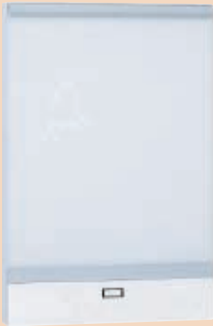
X-Ray Illuminator One Viewing Area Desk or Surface Mount - BB115 Recessed Mounting - BB118