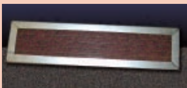
Potassium Permanganate Filter for MB & ME Models