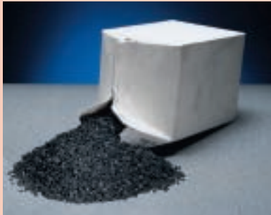
Activated Charcoal Bulk