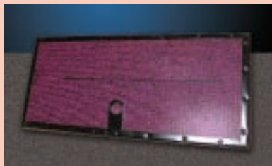
Potassium Permanganate Filter