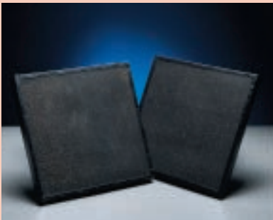
Charcoal Filter - BF002