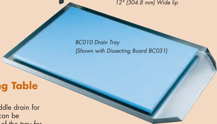
BC010 Drain Tray (Shown with Dissecting Board BC031)