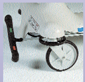
Heavy duty 8" diameter rubber edged casters. Dual activated Total-Lock wheel-locking system is built in.