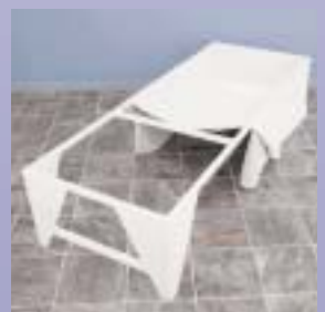
Removable, white aluminum frame construction for long life and easy clean-up. Removable washable cover is opaque with blackout lining.