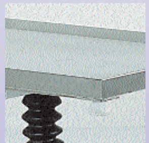
Contoured perimeter edges ensure retention and control of fluids.