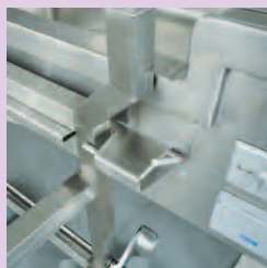
Autopsy Cart Latch