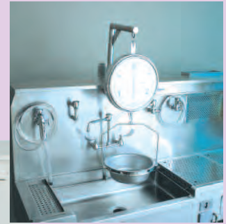
CO016 Optional Scale Stand Mounted on CC100