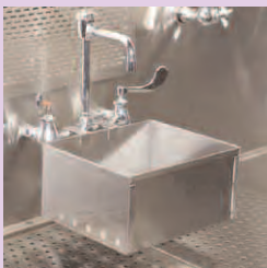
Optional CO020 Organ Rinse Basket

The ergonomic design of our CC100 Autopsy Sink eliminates the physical strain of moving bodies. The autopsy can be performed directly on the cart.