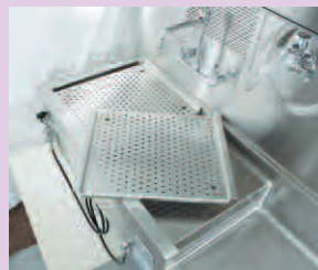
Dissection Area Grid Plates