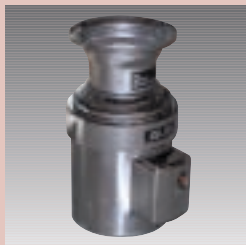
BL300 Heavy-Duty Disposal

The MB200 countertop model is ideal for smaller labs or used as a secondary station for larger facilities. Also available as a free standing unit