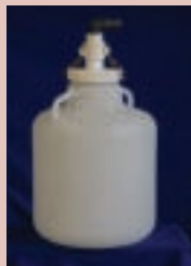
MB019 Formalin Collection