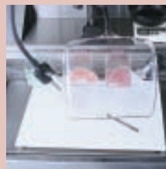
MB011 Safety Splash Shield