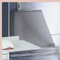
MB004 Dictation Equip. Stand