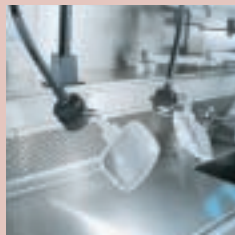
MB016 Dual Halogen Lights with MB013 Magnifying Lens