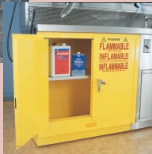
MB008 Flammable Storage Cabinet. Cabinet features two doors, an adjustable shelf and a key lock for added security