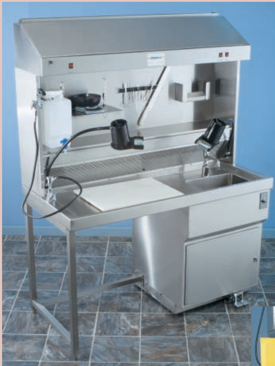
Mopec's MB400 free standing workstation features more usable space and an extra deep sink