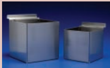
MB039/MB040 Stainless Steel Organizer Bin Dispensers