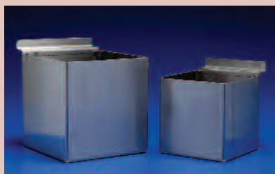
MB039/MB040 Stainless Steel Organizer Bin Dispensers