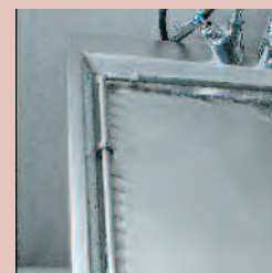
MB009 Perimeter Rinse System