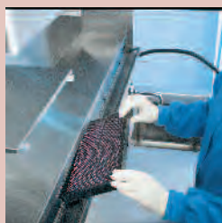
MB005 Exhaust System