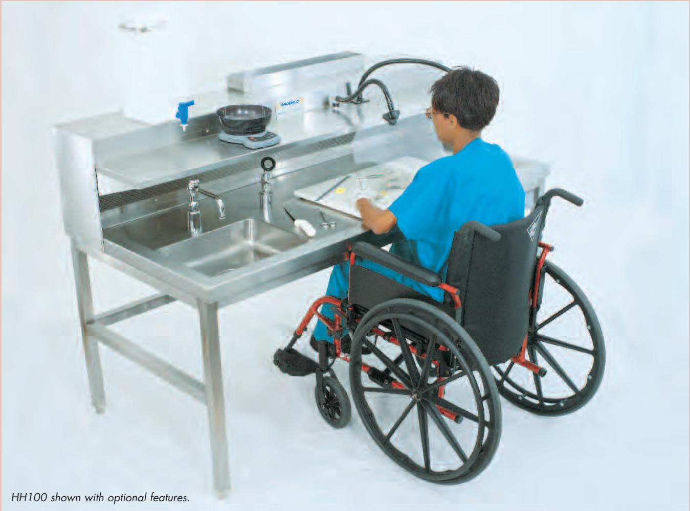
HH100 shown with optional features.