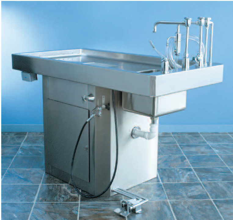
CE900 shown with optional foot pedal

construction eliminates sharp edges where bacteria can accumulate. All welded seamless construction provides durability.