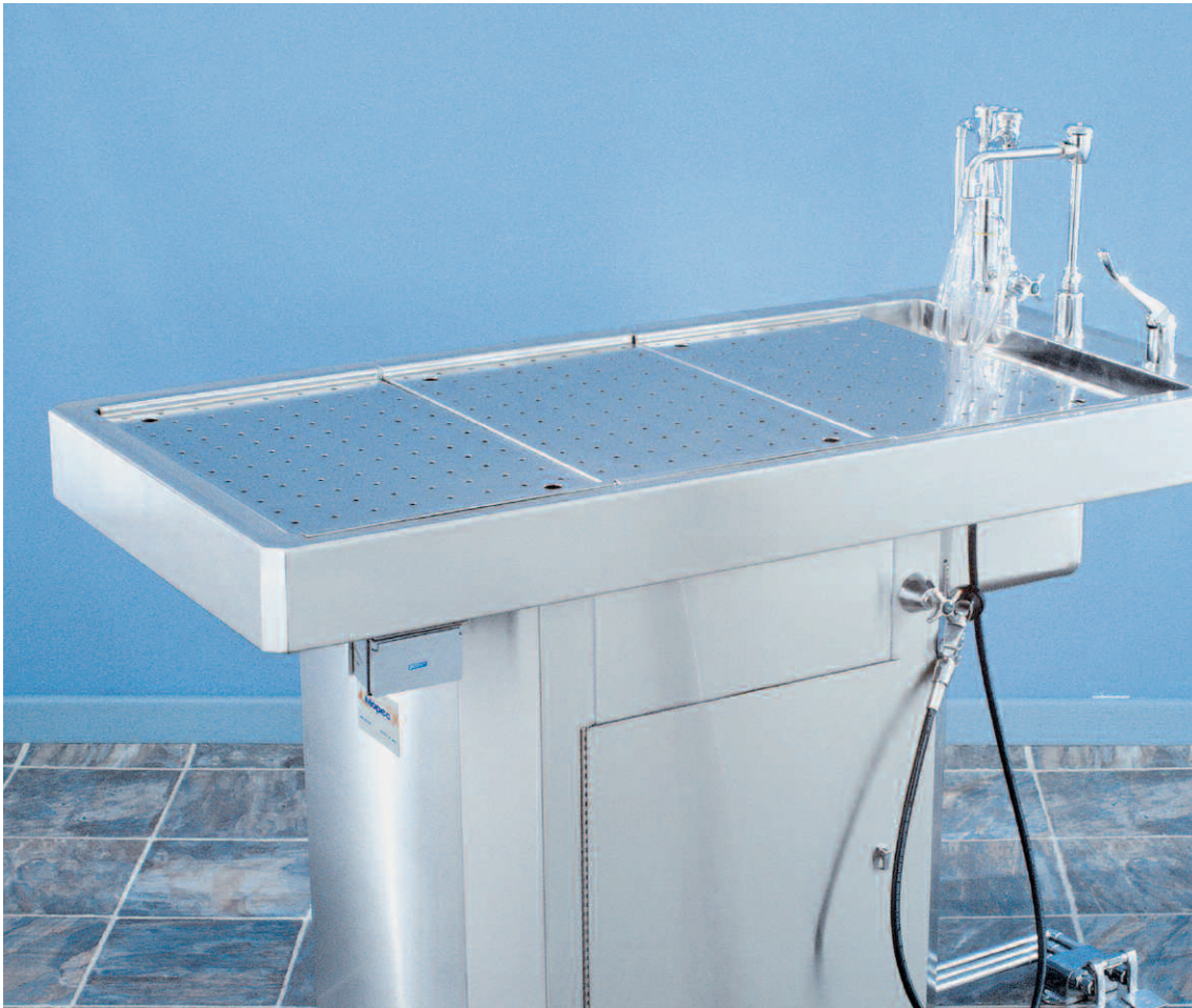
A hot and cold water faucet is provided with a single lever control and a vacuum breaker to safeguard the facility water supply. Shown with optional foot pedal.

The CE900 Autopsy Table is a pedestal style table of all stainless steel construction that incorporates all of the convenient features necessary to efficiently perform an autopsy. The CE900 is the shortest version of pedestal style autopsy tables and is ideal for pediatric institutions. This style also incorporates an integrally constructed sink into the table top as opposed to a sink wing. Unit comes standard equipped with Mopec's standard downdraft ventilation system.