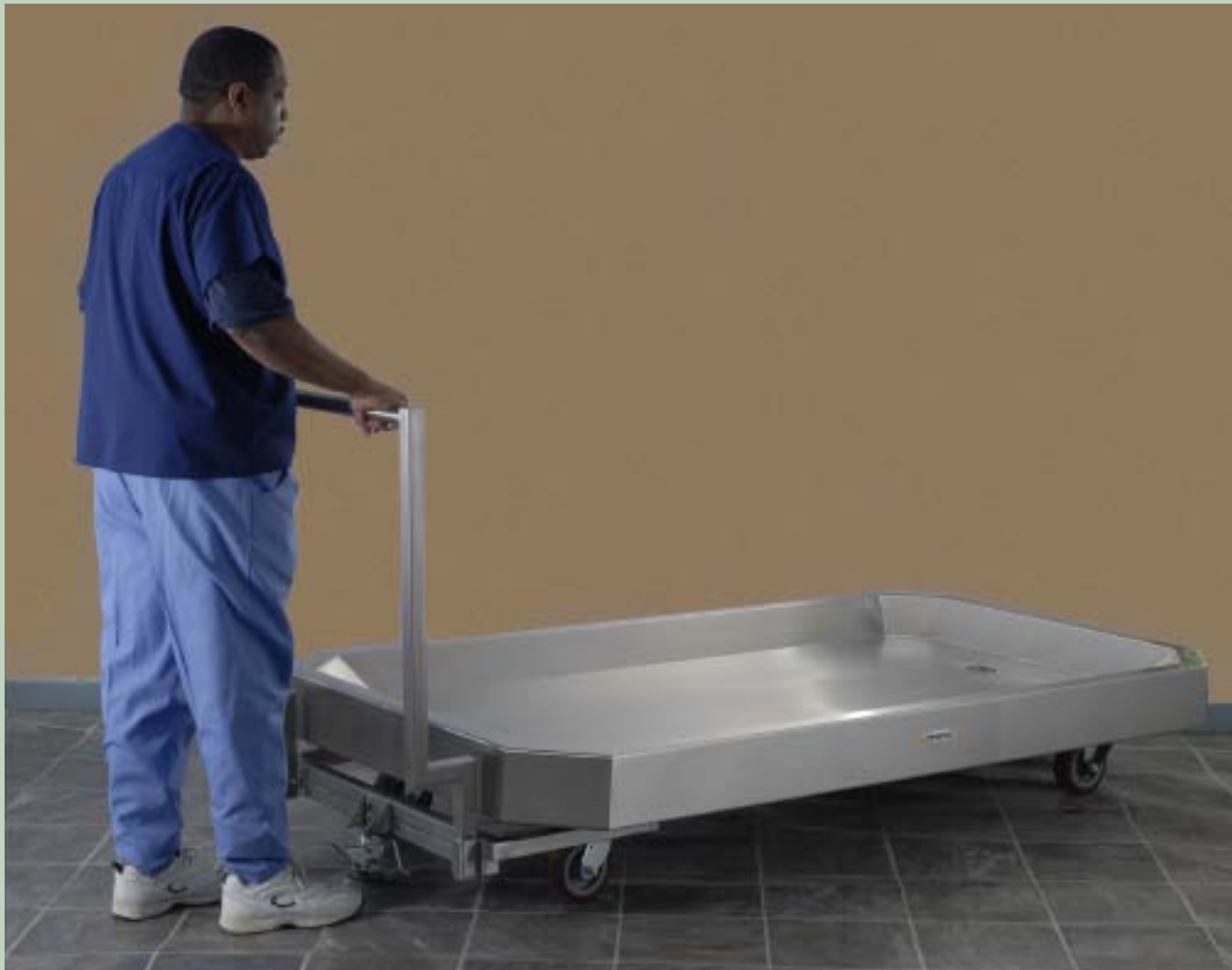
OA190 can easily transport large animals

This cart is a mobile unit that is excellent for transporting large animals throughout your facility. It is capable of carrying loads up to 1500 lbs, and is easily moved via a removable handle and a heavy-duty 6" diameter caster system featuring two rigid casters in back and two swivel casters in the front. A rear foot-operated brake brings the unit to a stop and keeps the cart in place while not in use.