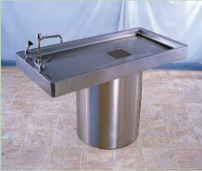
Shown here without perforated grid plates