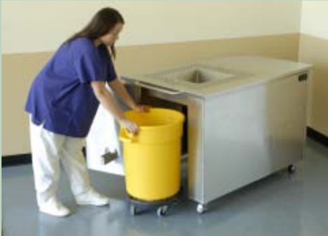
Portable Dumping Station features a 20 gallon mobile bucket