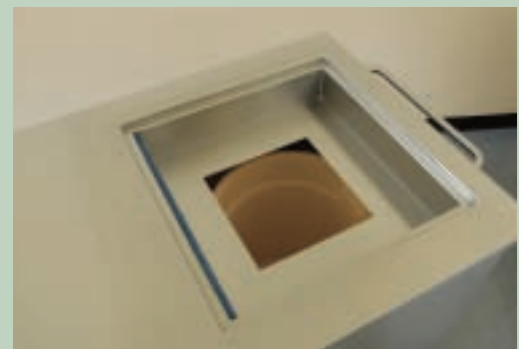
The OL100 is constructed of all stainless steel for easy cleaning

Powerful Hepa Filtration System: Dust control fume evacuation.