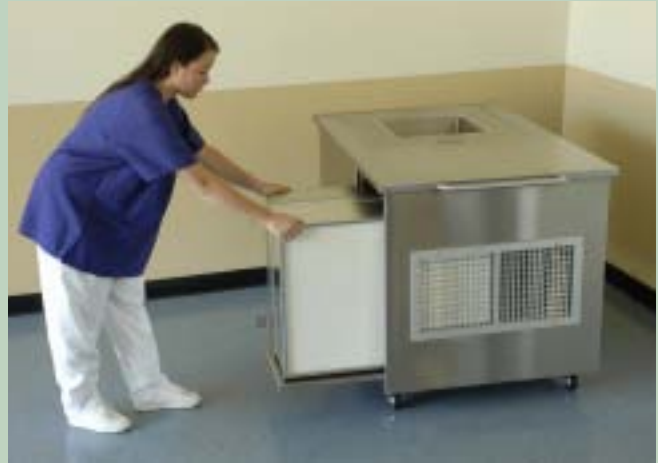
Extra large Hepa filtration with full service access