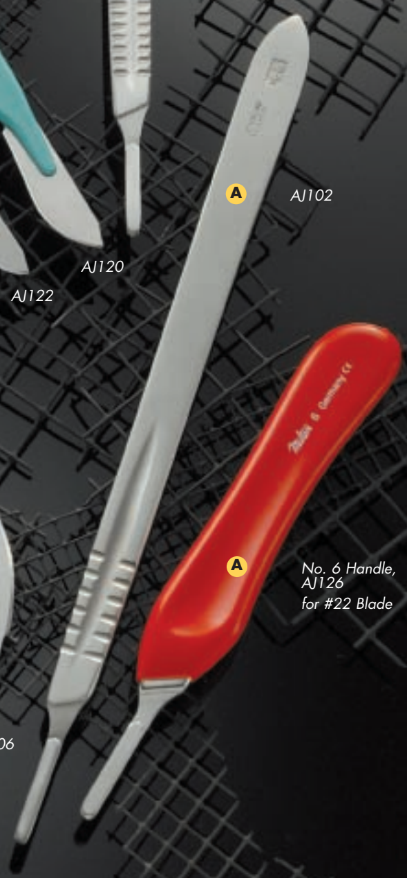
No. 6 Handle, AJ126 for #22 Blade