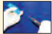
3. Blade is now in container