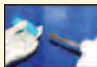
1. Insert handle and blade in remover