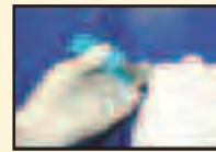
2. Press and hold while pulling out handle