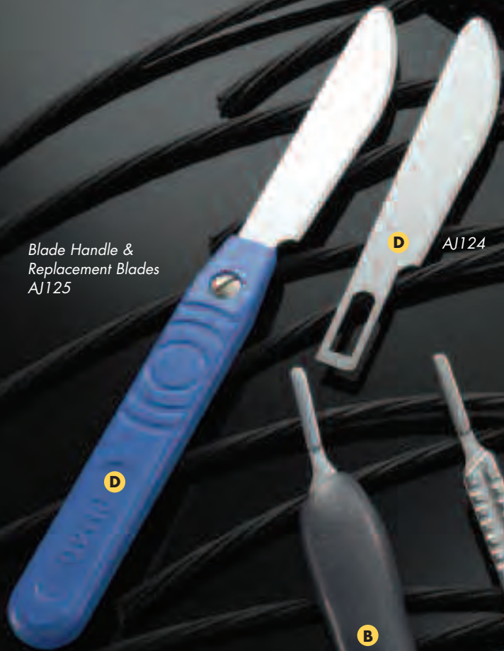
Blade Handle & Replacement Blades AJ125