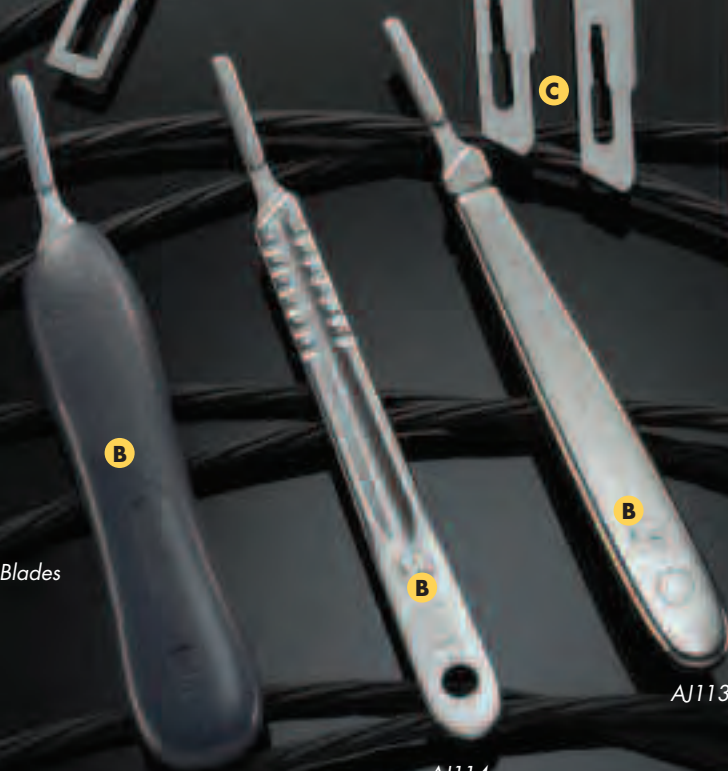
No. 8 Handle For #60/#70 Blades AJ115