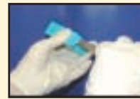
2. Press and hold while pulling out handle