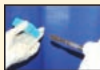
1. Insert handle and blade in remover