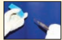
3. Blade is now in container