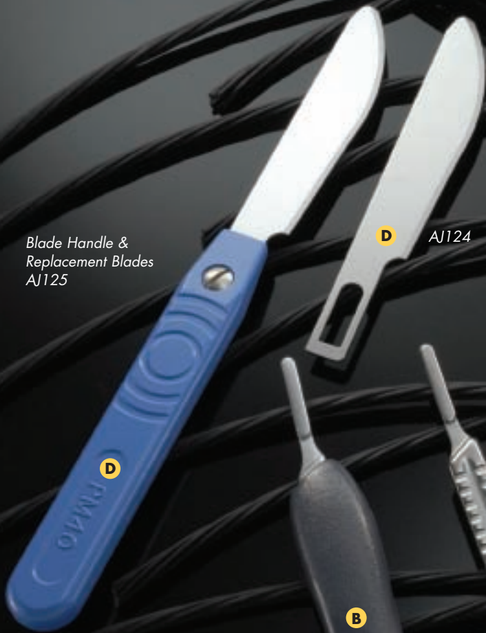
Blade Handle & Replacement Blades AJ125