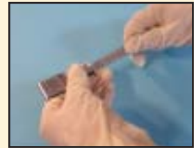
2. Holding blade remover firmly down, pull out handle.