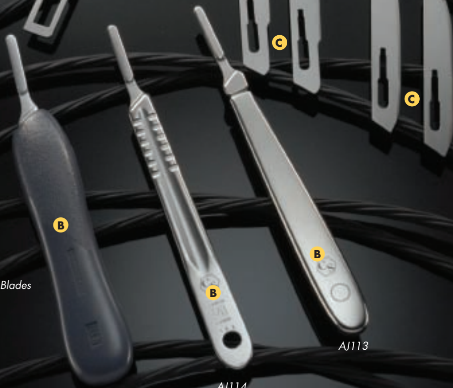
No. 8 Handle For #60/#70 Blades AJ115