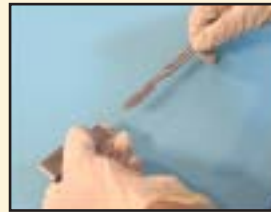
1. Insert blade and handle into blade remover